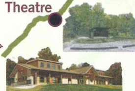
Bera College Forestry Outreach Center